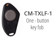
CM-TXLF-1 One - button key fob